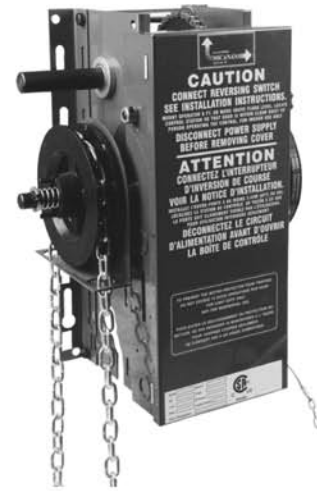
Commercial limited duty belt drive jackshaft operator with emergency chain hoist